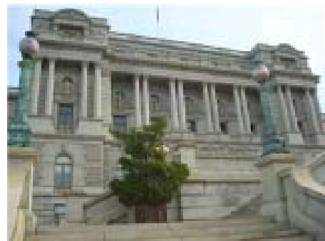
The Library of Congress